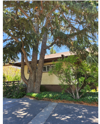
No more low-hanging branches above the hondo nor touching the roof. Thank you.